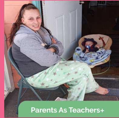
Parents As Teachers+