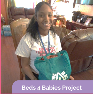
Beds 4 Babies Project

"I have learned that my baby is to sleep without stuffed animals, pillows and no blankets in bed. I am also not to sleep with her because I can roll over her and hurt her. Next week we are going to set up the nursery. I am going to breastfeed and I will be pumping since I go to school. I hope to graduate in three years and then go to college."