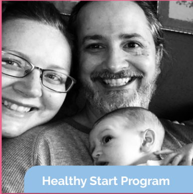
Healthy Start Program

"I cannot imagine how challenging my journey into motherhood would have been without Healthy Start Pinellas. Our family is incredibly lucky to have such an amazing support group. Who knew that by signing up for a program at the health department without knowing much about it, would turn into such a positive experience."