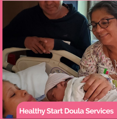
Healthy Start Doula Services