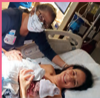
Healthy Start Doula Services