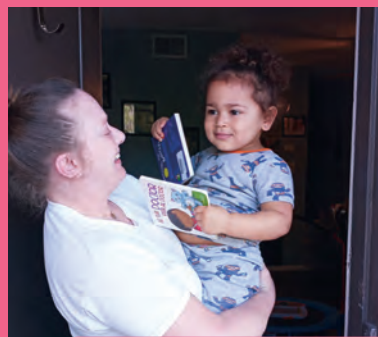
Parents As Teachers+