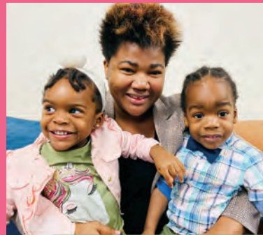
Healthy Start Program