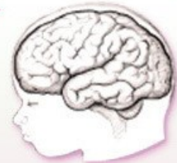
39 to 40 weeks